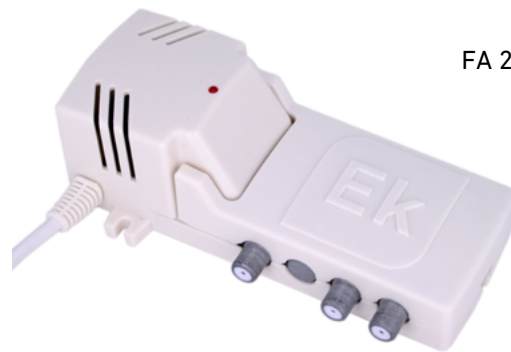
FA 242 / FA 121