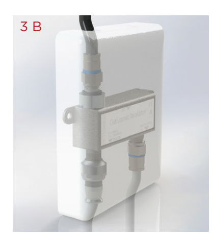
DVU 1-4 GI LTE