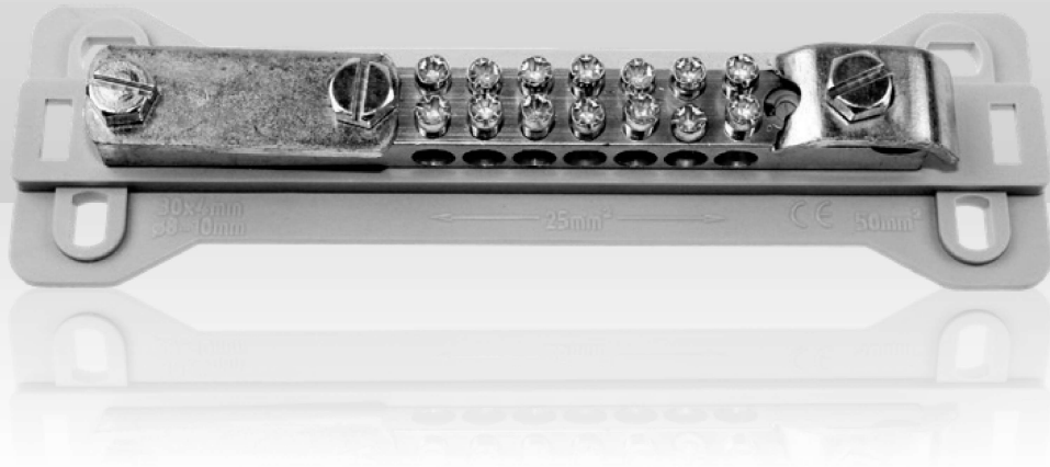
41011505 Potential equalization bar