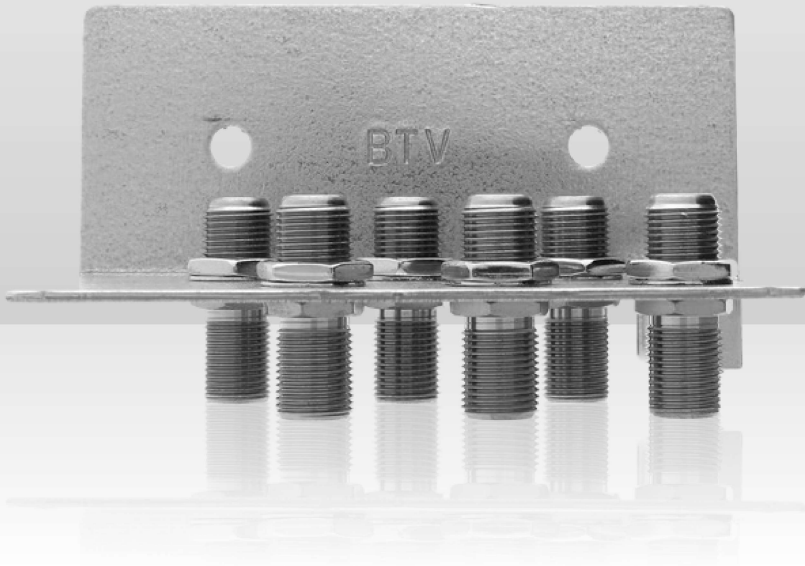
42090600 Grounding block 6-way HQ